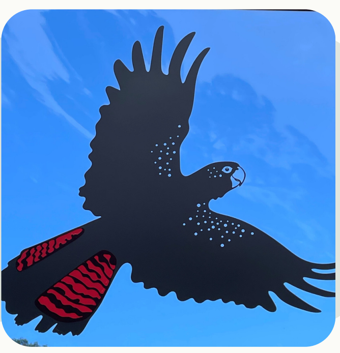
Full Bird - $80